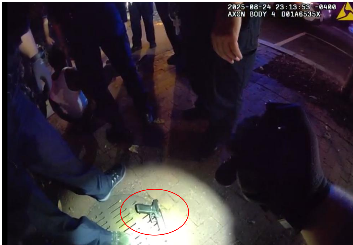
Figure 1 - The firearm recovered from BRYANT's person, circled in red.

While in custody, BRYANT spontaneously stated that the magazine from the firearm was located inside his vehicle. The officers located BRYANT's vehicle across from 1734 14 th Street NW. A gun-detection dog was brought to BRYANT's vehicle and indicated a positive hit. A search of the vehicle was conducted, during which a magazine compatible with the firearm recovered from BRYANT was located, along with ammunition and a shotgun.