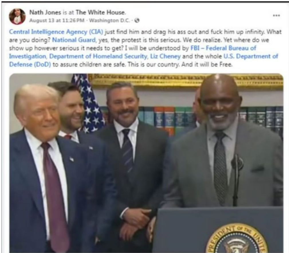
Figure 2: August 13, 2025, Facebook Post from “Nath Jones”