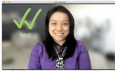
Facing the window, even natural light