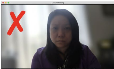
Face is dark with light behind you