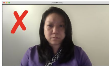
Bad lighting in your room