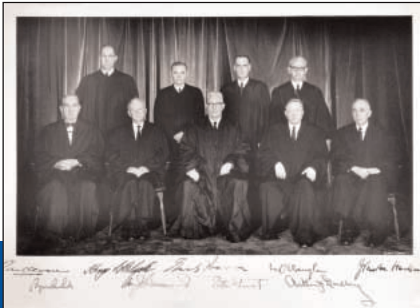
The Warren Court (right) decided Gideon v. Wainwright on March 18, 1963.

trial because he did not have the assistance of counsel at his trial. In 1963, the court agreed to hear Gideon's case and ruled that a state must provide legal counsel to anyone charged with a felony who cannot afford a lawyer. The Supreme Court found that the Sixth Amendment's guarantee of counsel is a fundamental right, essential to a fair trial. Gideon was retried and acquitted . His lawyer in the second trial asked the taxi driver – who had given damaging testimony during the first trial – if Gideon had ever asked him before to deny that the driver had picked him up. The taxi driver responded that Gideon said this every time the driver picked him up and suggested that it was because of a problem with his wife.